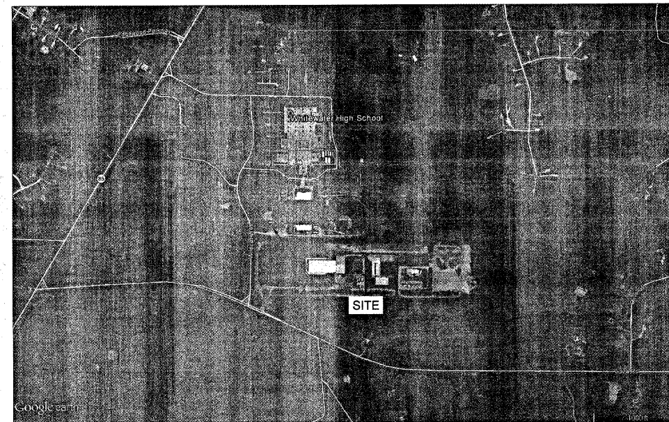
LOCATED IN LAND LOT 229 OF THE 4TH DISTRICT, FAYETTE COUNTY, GA