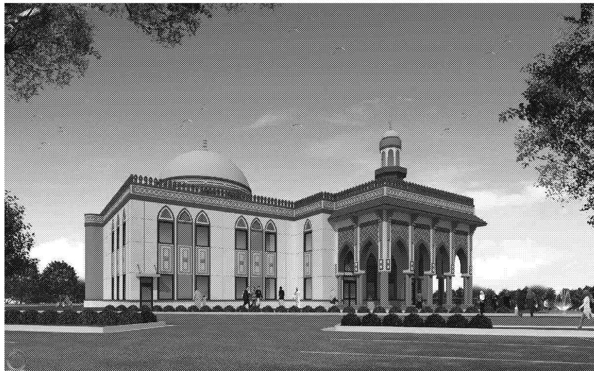
NORTH - WEST VIEW