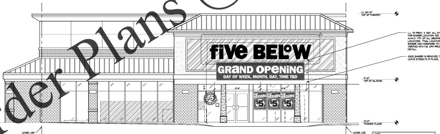
2 EXTERIOR BANNER LOCATION WITH NO TAG LINE SIGN